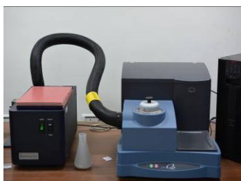
Differential Scanning Calorimeter