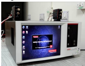
Keithley 4200-SCS Parameter Analyzer