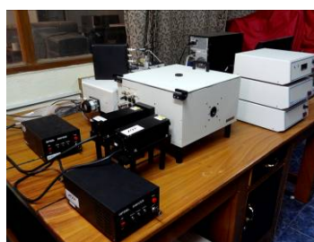
Photoluminescence (PL) measurement unit