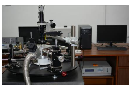
Cryo-cooled Electrical Probe Station