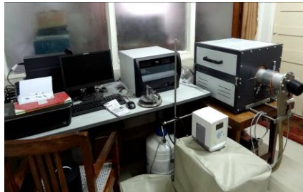
Thermal transport measurement facilities